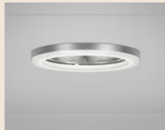
Mirror-finish edging ring with decorative glass.