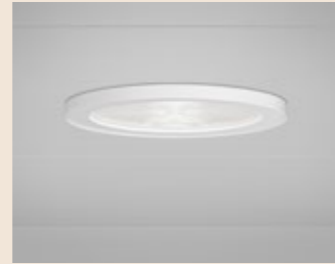
White edging ring with circular micro-prismatic acrylic sheet.