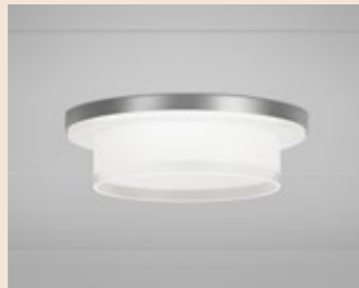
Mirror-finish edging ring with decorative glass and sand-blasted cylindrical glass with clear lower edge.