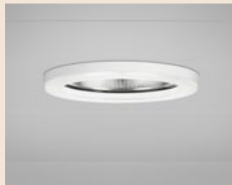
White edging ring with decorative glass.