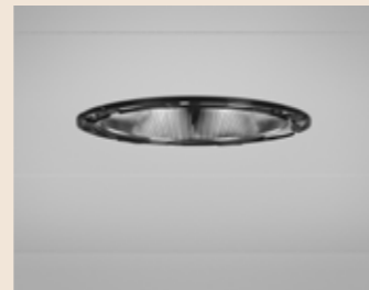
Installation ring for decorative glass (included).