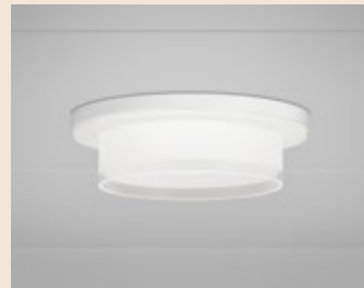
White edging ring with decorative glass and sand-blasted cylindrical glass with clear lower edge.