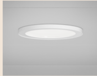
White edging ring with micro-prismatic acrylic sheet