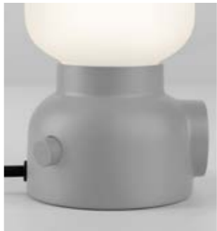
Dimmable via rotary control.