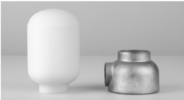
Opal glass shade and luminaire body in die-cast aluminium.