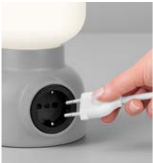
Integrated electrical socket.