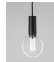
Cob incl. light source Caret Globe

L 1050000013 = Cobbler including light source Caret Globe with black main shade and white decorative shade.