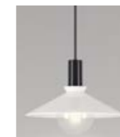
3: Cobbler White