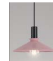
5: Cobbler Pink