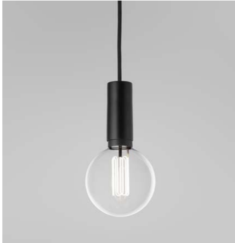
Cob including light source Caret Globe