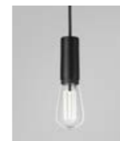
Cob incl. light source Caret Standard