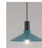
4: Cobbler Blue