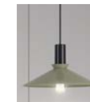
6: Cobbler Green