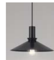
1: Cobbler Black