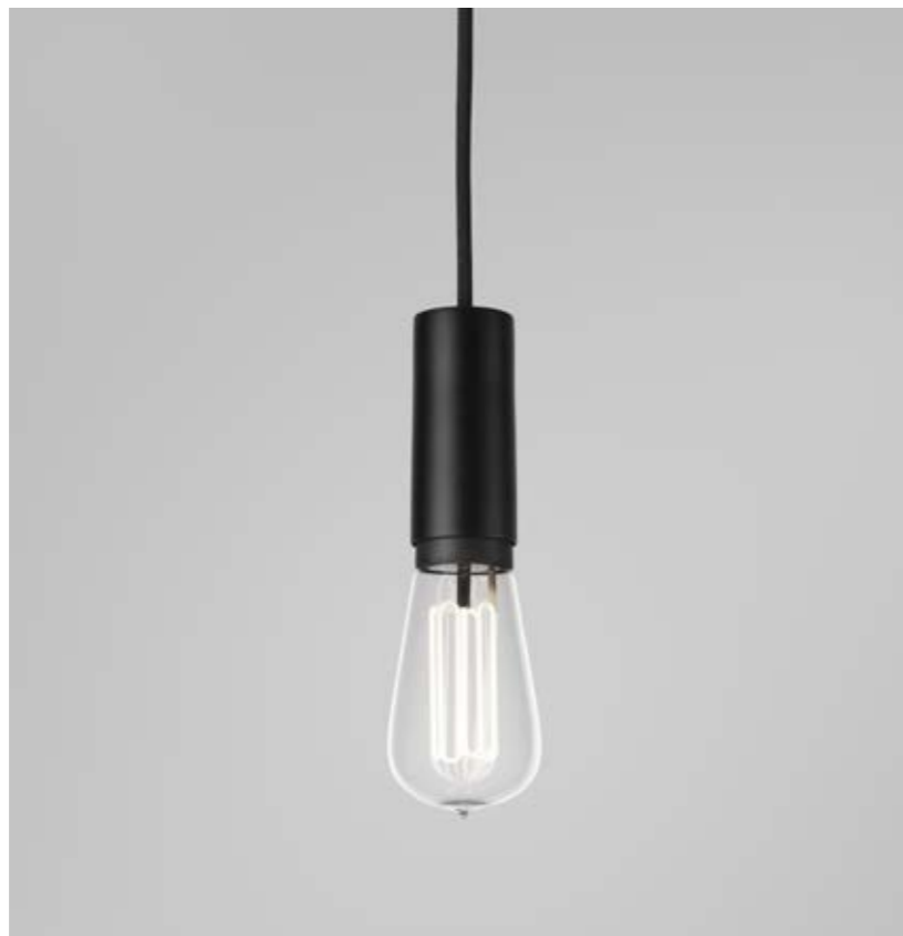
Cob including light source Caret Standard