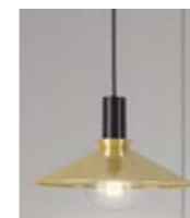
2: Cobbler Brass